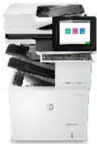
HP LaserJet Managed Flow MFP E62665z