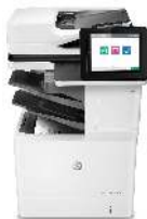
HP LaserJet Managed Flow MFP E62665hs