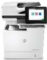
HP LaserJet Managed Flow MFP E62665h